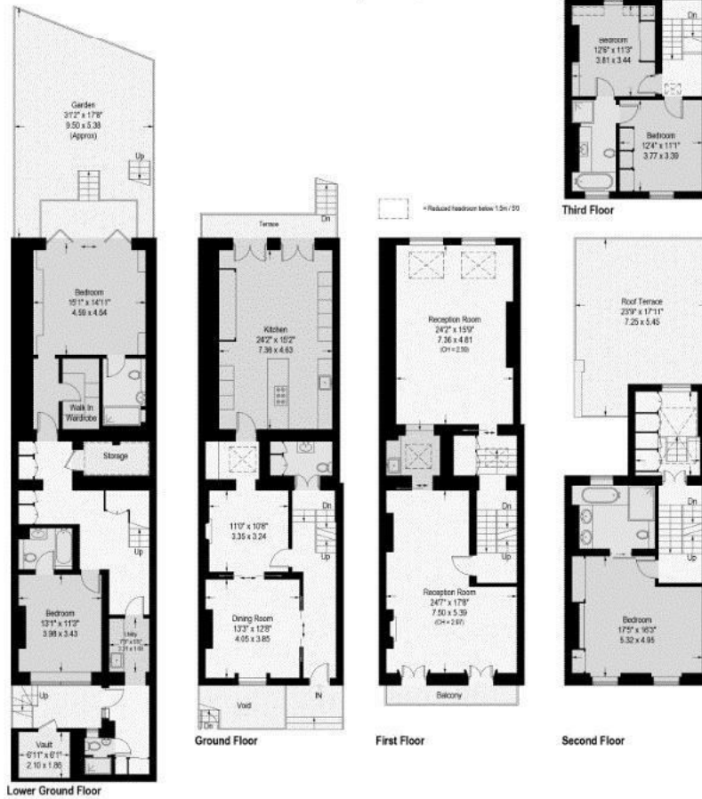
Illustration for identification purposes only, measurements are approximate, not to scale. (ID601322)